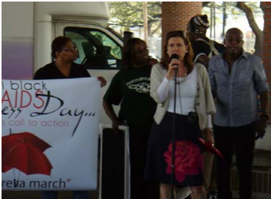
Participates in the Red Tent – National Women & Girls HIV/AIDS Awareness Day in Treme.