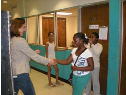
Councilmember speaks with Cops for Kids Summer program children.