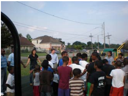
Joins in prayer with neighborhood residents during the National Night Out Against Crime.