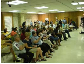
Residents attend Town Hall Meeting to discuss ongoing projects and concerns in their neighborhood.