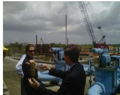
Tours the west bank pumping station.