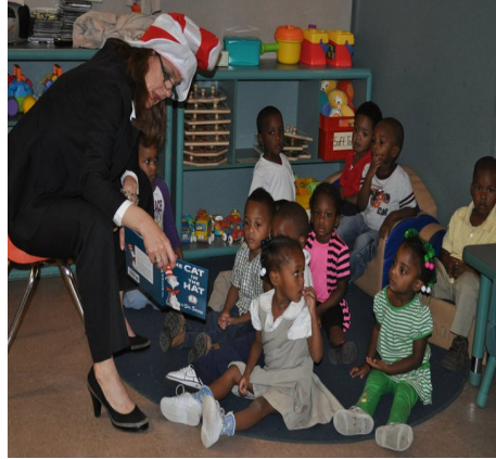
Participates in Read Across America with the children at the Urban League Head Start Center.