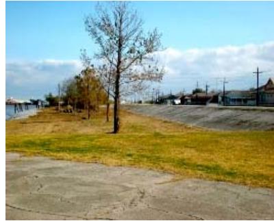
The Southeast Levee Protection Authority – West cleared debris from the batture at Algiers Point.